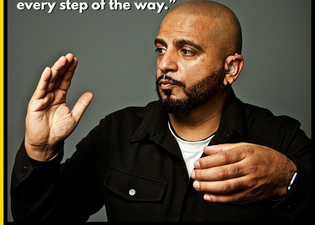
Made in India Britain, 2022

“Thank you very much to the Generate fund for allowing me to educate everybody about my dynamic journey... I never thought I would be doing theatre in the Fringe one day, but I have loved every step of the way.”